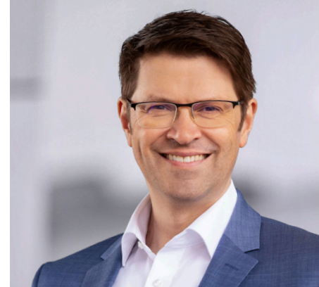
Oliver Zipse Chairman of the Board of Management of BMW AG

A handwritten signature in blue ink, appearing to read "O. Zipse".